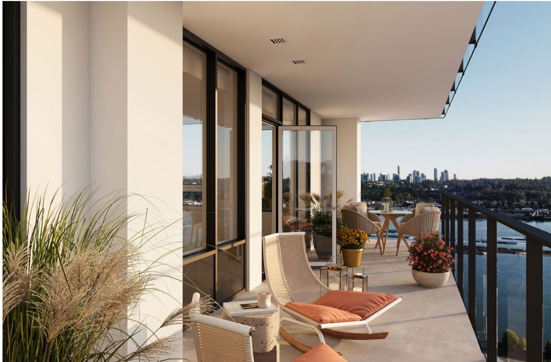
Vistas display the majestic Fraser River, mountains, and horizon, while closer views hold the lively energy of Fraser Mills.

Set close to the Fraser River, Encore is home to breathtaking views. To the south, gaze over the water and beyond across the Fraser Valley, while the northern views showcase Coquitlam through to the North Shore mountains. When day transitions to night, these panoramic scenes hold the lights of the surrounding cities.