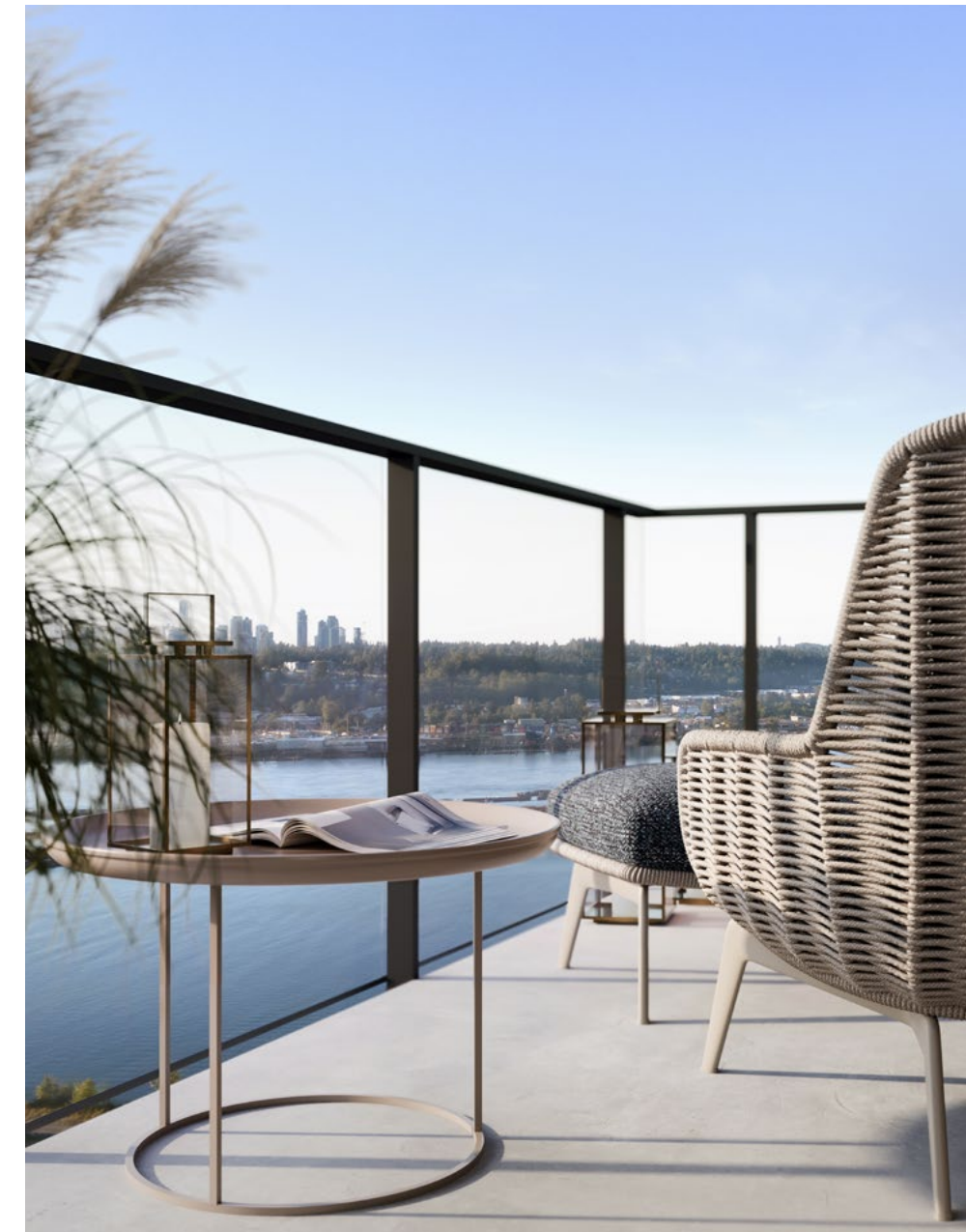
Small rituals give way to special moments enjoyed in the luxury and comfort of home.