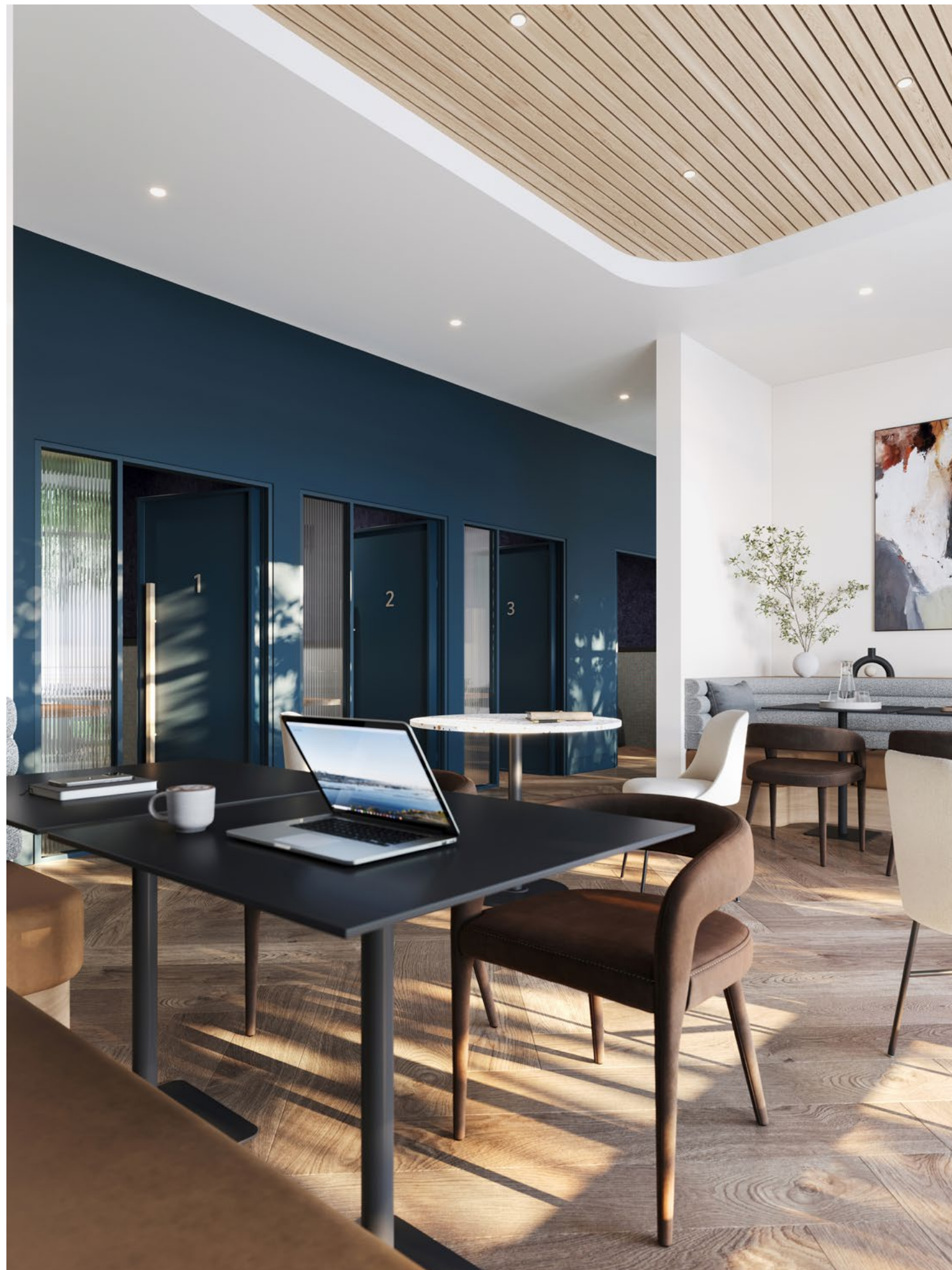
Get more done in the coworking lounge's three distinct zones, acoustically separated to foster various levels of both focus and collaboration.