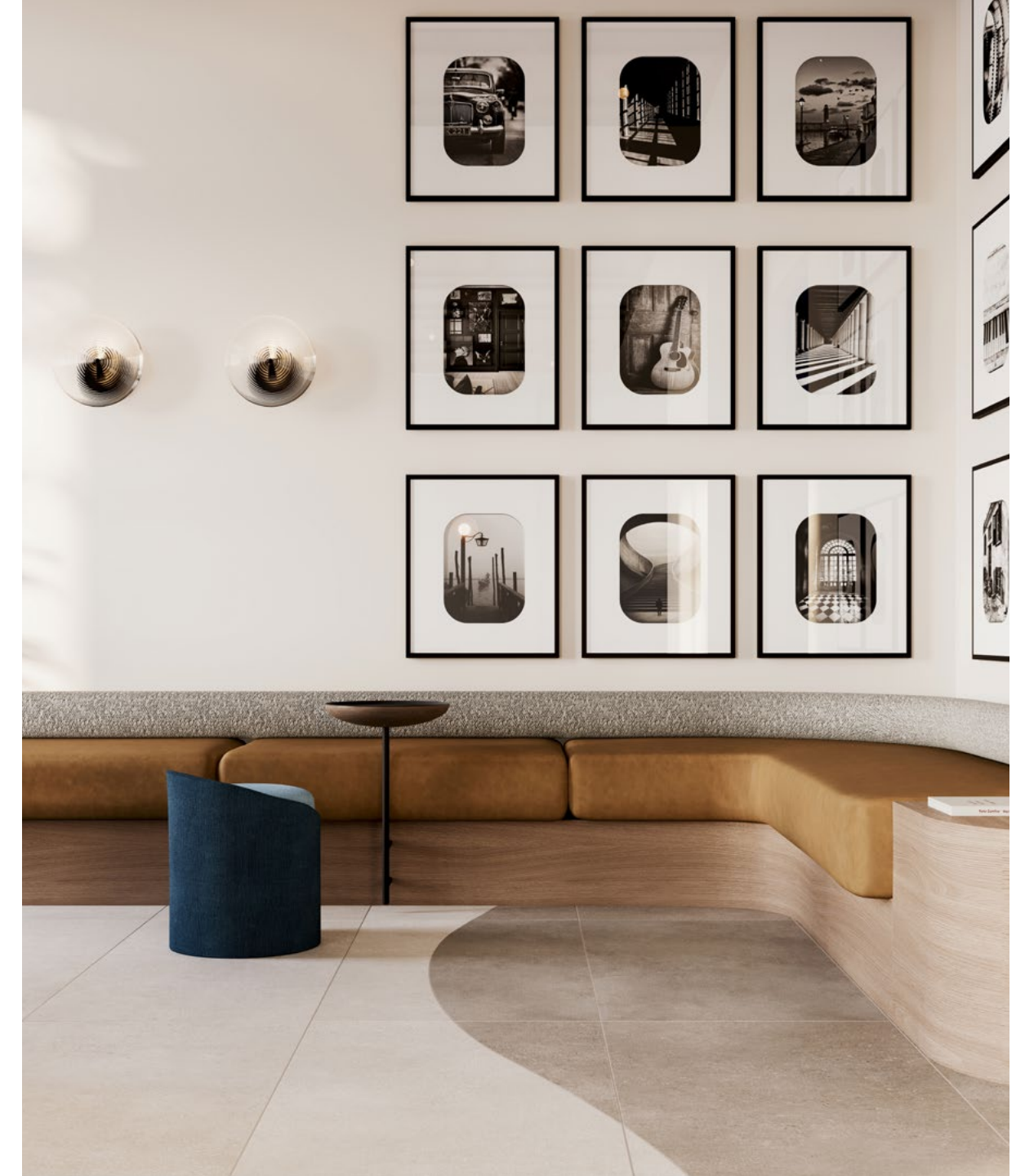
Comfortable and design-forward seating in the lobby makes an excellent first impression for residents and guests.