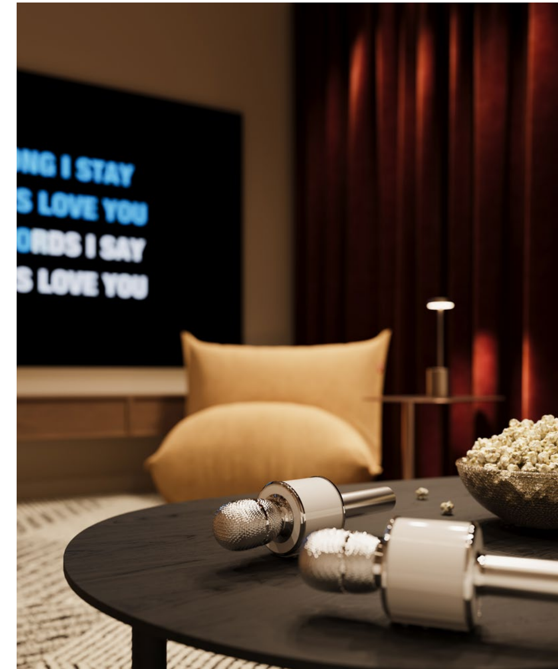
A unique karaoke room is set off the lounge, ready to entertain parties of all ages. With a large screen TV and ample seating, sub the karaoke tracks for your favourite movie.