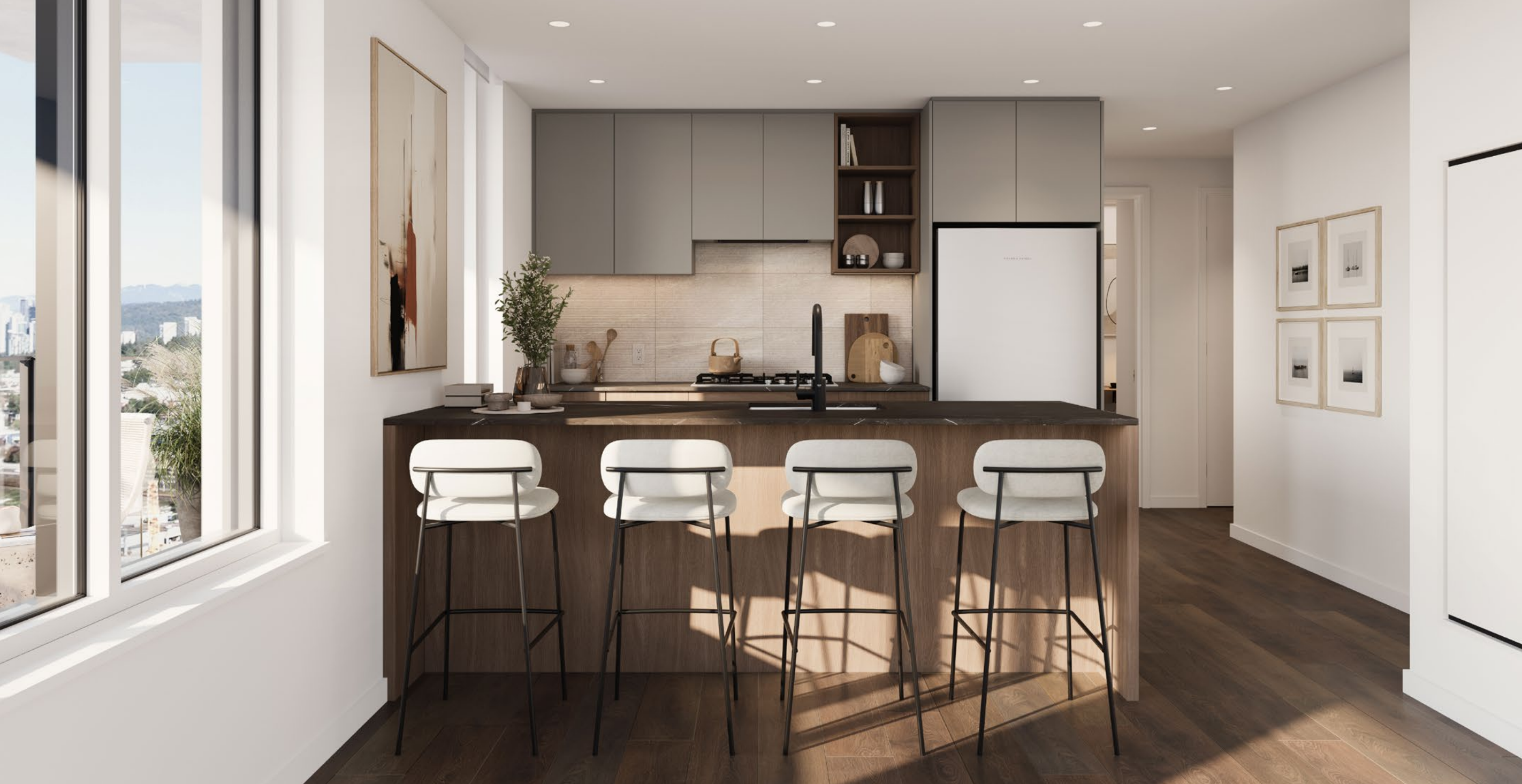
Rich and inviting, the Grove palette uses dark, robust browns and deep greys with matte black fixtures for a distinctly inviting environment.