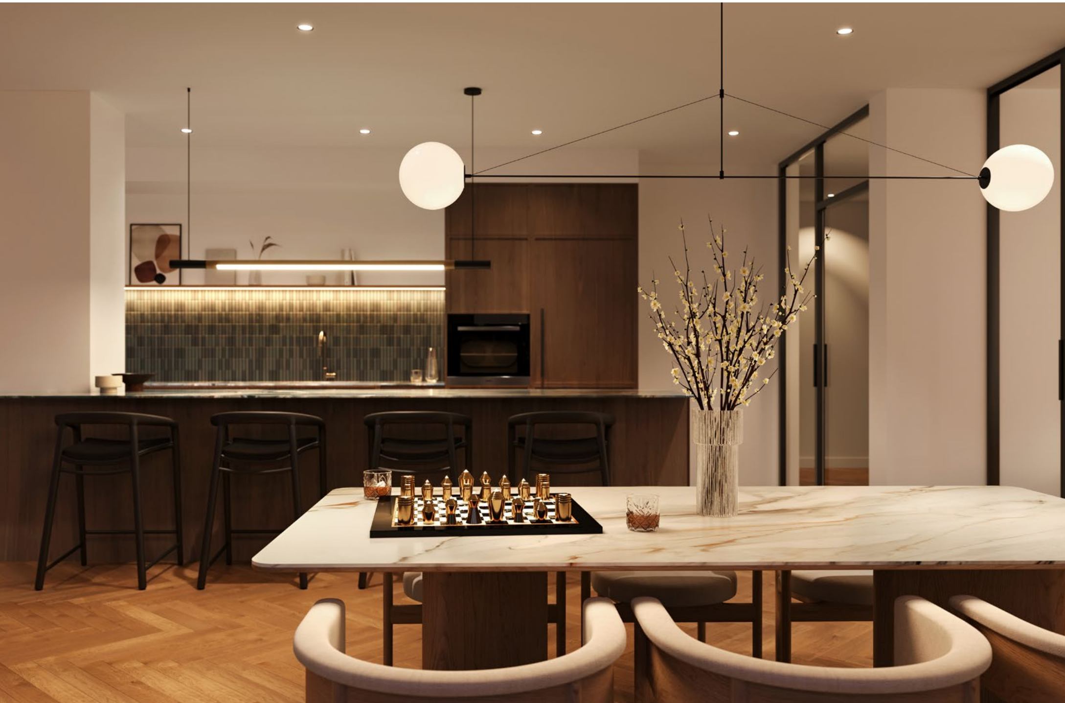
Revisit the joy of hosting with the entertainment lounge's catering kitchen. Meals, games and conversations are shared over the large dining table.

Encore's sprawling outdoor space extends over its podium. The outdoor kitchen's fireside lounge, BBQs and harvest table provide the settings for socialization. A ping pong table and open grass area bring play forward. The communal herb garden, walking path, and grove of broadleaf trees create meditative moments amid nature.