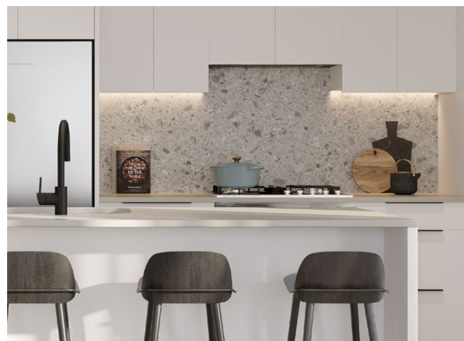
The bold, stylish Mill palette features a black and grey terrazzo patterned backsplash.